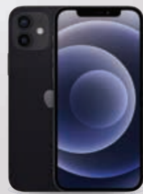
iPhone 12 256GB 5G

Our eSIM Tech wearables are compatible with Vodacom OneNumber, a service that keeps you connected via your smart watch. Find out more at vodacom.co.za