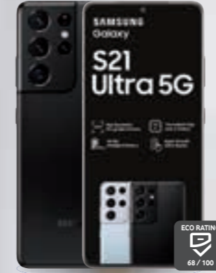
Samsung Galaxy S21 Ultra 5G