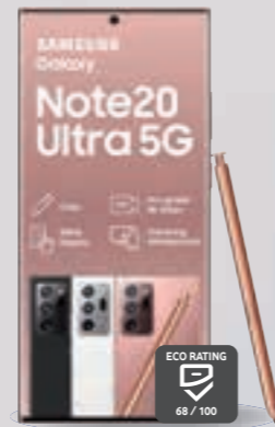
Samsung Galaxy Note20 Ultra 5G