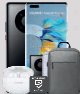
Huawei Mate40 Pro