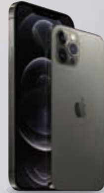
iPhone 12 Pro Max 256GB 5G