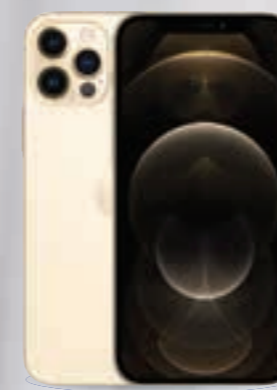
iPhone 12 Pro 512GB 5G